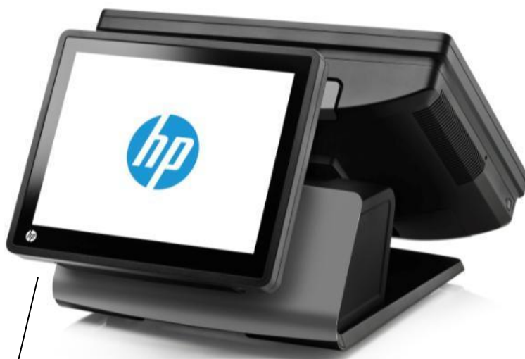
HP RP7 10.4-inch CFD Display (B0T22AV/QZ702AA) 11

Note: All product images depict the Projected Capacitive display.