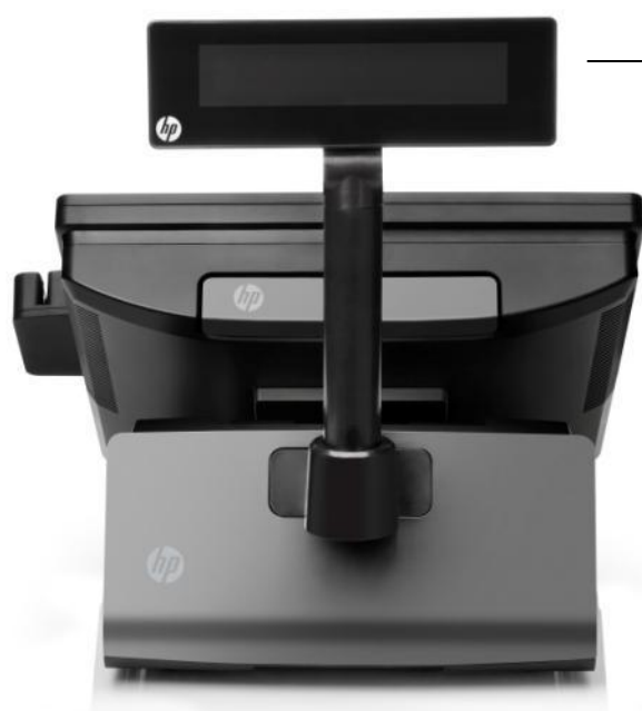
HP RP7 VFD Customer Display (B0T26AV/QZ701AA) 11